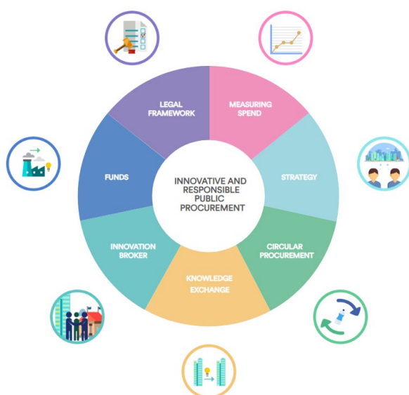
Figure 1: Modules of the E-Learning of UA IRPP

The training sessions aim to deliver legal assistance on the legal aspects of procurement of innovation. This legal framework module consists of several procedures and instruments. Therefore, the consortium decided to build the training sessions around these procedures and instruments.