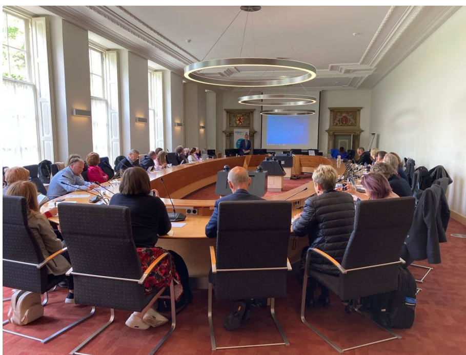
Figure 4: The first and third legal framework training sessions were held in the council chamber of the Municipality of Haarlem

The first training served as an introductory training set to the series of training sessions on capacity building with regard to the legal framework of innovative procurement. From there on, the training sessions dived into several legal procedures and instruments. For the second training, the partners of the consortium saw an opportunity to combine a training with the Mayor's Covenant of the Municipality of Gabrovo, Bulgaria, which was held in July 2023. This event had a broad outreach to our target groups. In collaboration with a Bulgarian translator, a training on market consultation has been provided. To make use of the designed training to the fullest, the partners decided to offer the same training also to the broader public. That is why an extra training was held as an online webinar, in addition to an online Urban Agenda Partnership meeting. The third set of training sessions covered