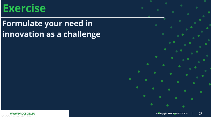
Figure 8: Example of an Exercise Used in the Pre-Commercial Procurement Training