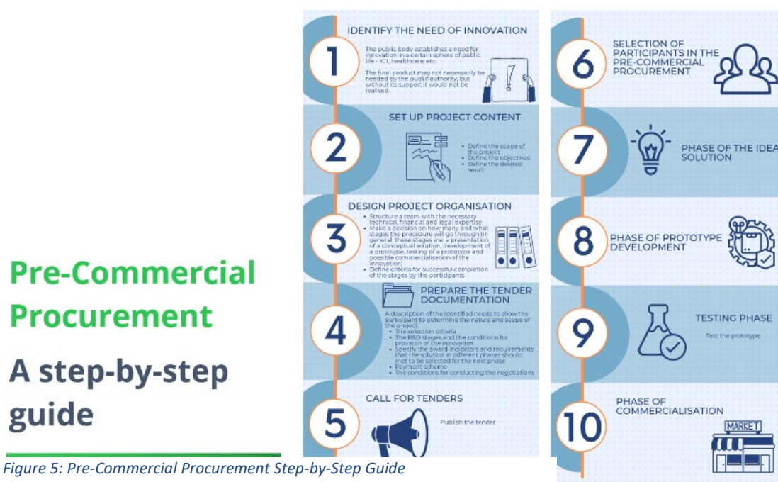
Figure 5: Pre-Commercial Procurement Step-by-Step Guide

Figure 5 displays a PowerPoint slide of the opening of the training by portraying an overview of the steps of the procedure that will be discussed step-by-step and Figure 6 displays a PowerPoint slide of the case example that accompanies the specific procedure, in this case, pre-commercial procurement.