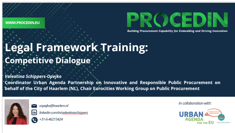
Figure 2: First slide of one of the legal framework training sessions