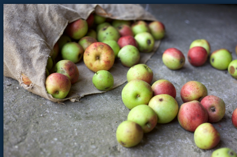
REDUCING FOOD WASTE