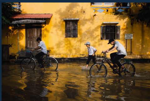
REDUCING URBAN FLOOD RISK