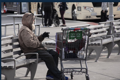
CARE FOR HOMELESS PEOPLE